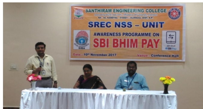
Awareness program on “SBI BHIM PAY” on 10-11-2017