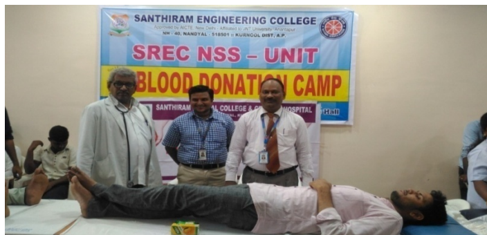
“BLOOD DONATION” on 25-10-2017