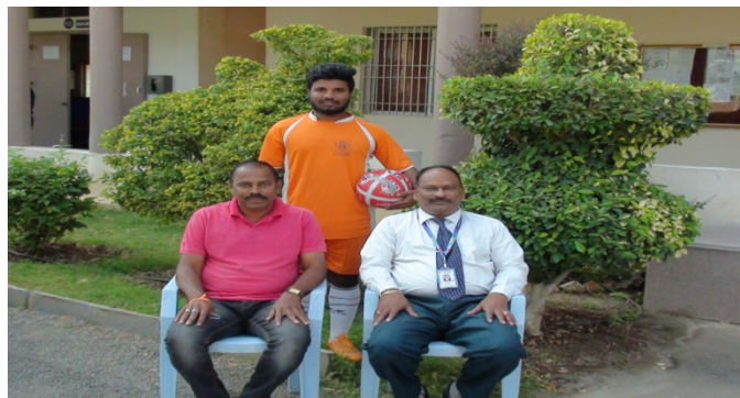
Student selected for Football @ JNTUA