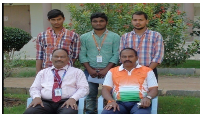
Students selected for Fencing for Kurnool Dist.