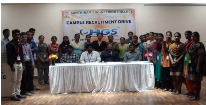
HGS on 27-12-2017