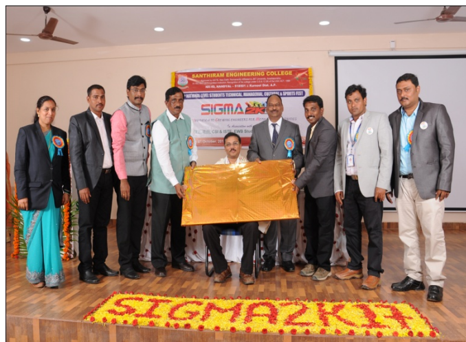
Felicitation to the Chief Guest