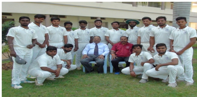
Students selected for Cricket @ JNTUA