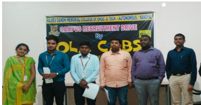
OLA CABS on 29-12-2017