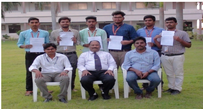
VESPA on 18-12-2017