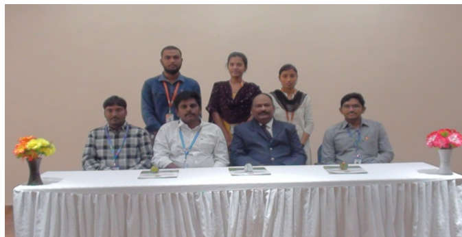
FIDELIS on 30-12-2017