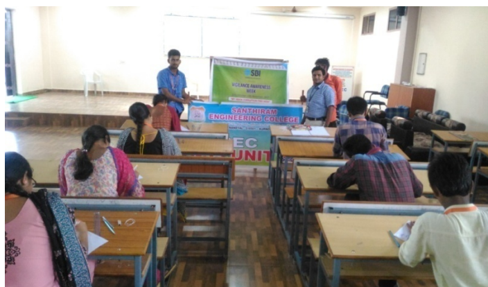
Essay Writing and Elocution Competition on “MY VISION- CORRUPTION FREE INDIA” is held in collaboration with SBI on 25-10-2017