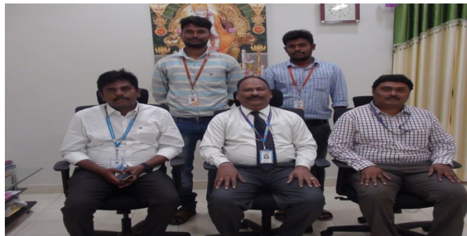
VIJAYA ELECTRICALS on 28-12-2017