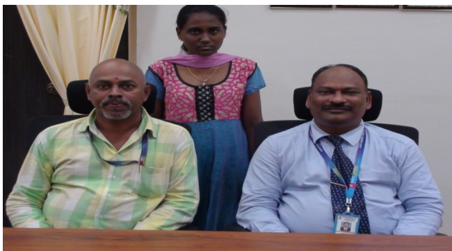
Student selected for Chess @ JNTUA