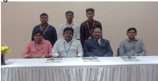
KALYANI MOTORS on 16-12-2017