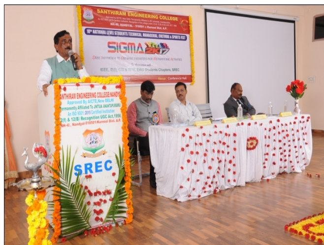
Chairman Addressing the gathering