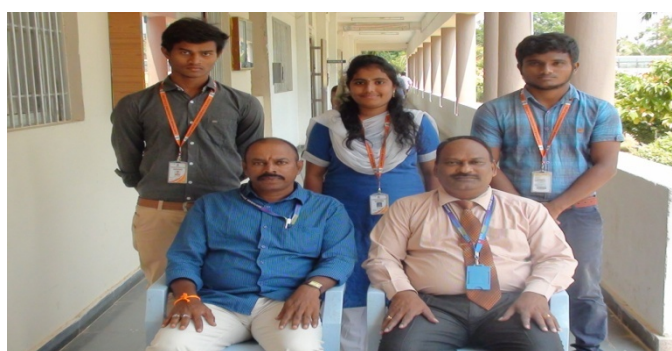
Students selected for Fencing @ JNTUA