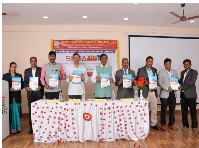
Releasing of SIGMA-2K17 proceedings