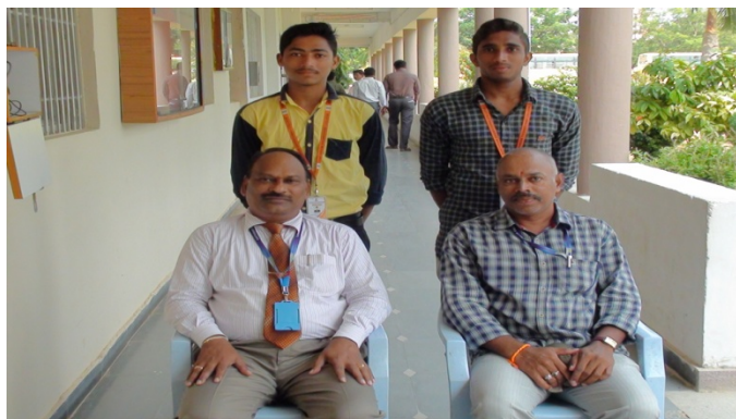
Students selected for Kho-kho @ JNTUA