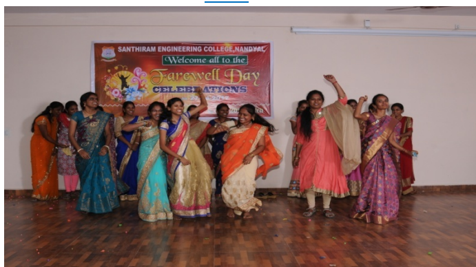
On 28/04/2017 The Dept of MBA celebrated Farewell day to 2015-17 Batch students.