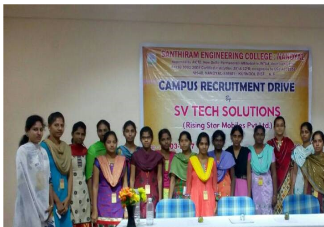
SV TECH SOLUTIONS, HYDERABAD DATE:07-03-2017