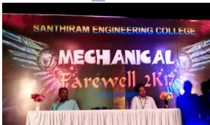
The Department of Mechanical Engineering has conducted Farewell Day on 21/04/2017 for 2013 Batch Students