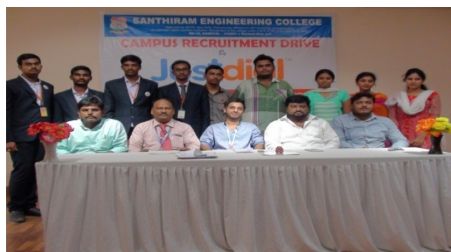
JUST DIAL, DATE:13-05-2017