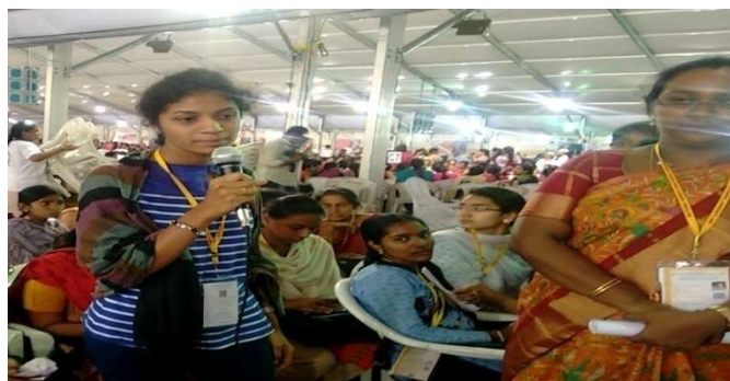
Students in the Debate