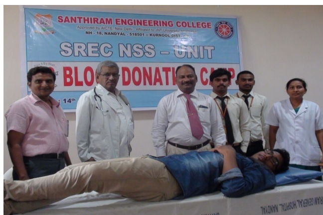
SREC-NSS UNIT conducted BLOOD DONATION CAMP on 14-03-2017 and 40 units of blood-donated by NSS volunteers.