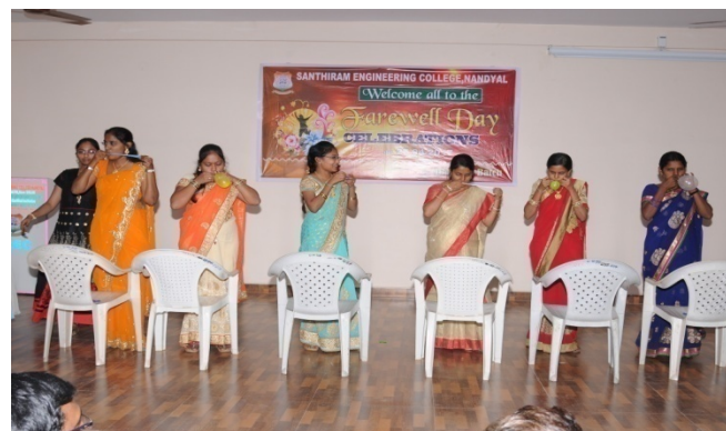
MBA Senior Students actively taking participation in the games activities.