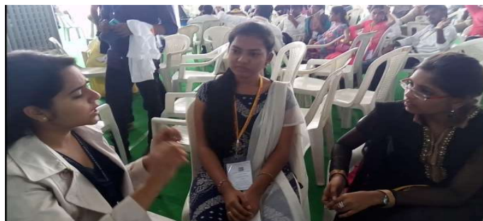
Students in the Group Discussion