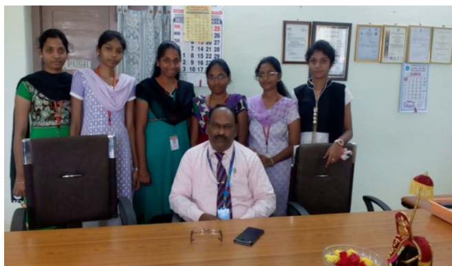
KARVY COMPUTERSHARE, HYDERABAD DATE:03-03-2017