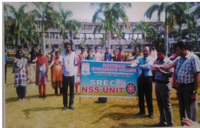
Organized 7 th NATIONAL VOTERS DAY on 25-06-2017 and all given oath of using vote right.