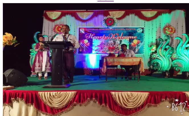
The Department of CSE conducted Farewell Day on 18-04-2017 for 2013 Batch students.