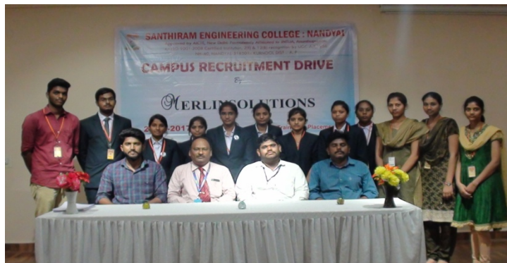
MERLIN SOLUTIONS HYDERABAD DATE:15-03-2017