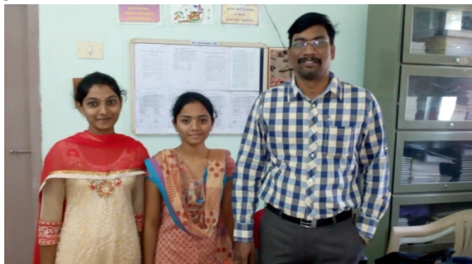
INVENSIS, BANGLORE, DATE:04-02-2017