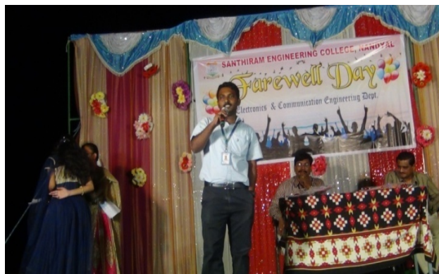
The Department of ECE organized Farewell function on 20/04/2017 ECE students.