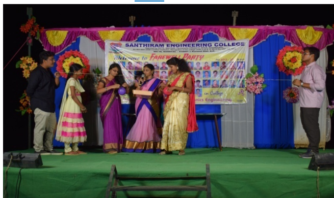
The Department of Electrical & Electronics Engineering organized the Farewell Day to 2013 Batch Students on 19-04-2017 .