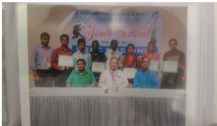
NSS UNIT LEVEL YOUTH FEST on 05-01-2017 and winners received certificates from Principal of SREC.